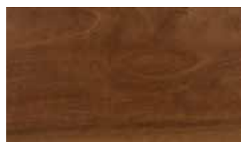
Classic Spotted Gum

Afraid your floors might be making your home smell like a doghouse? Have no fear, STAINMASTER™ PetProtect™ hybrid flooring is here, and it actually resists the absorption of pet accidents. Those lingering smells from Spot's puppy training days won't be a blast from the past.