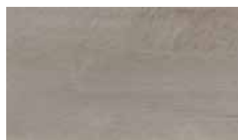
Antique White Oak